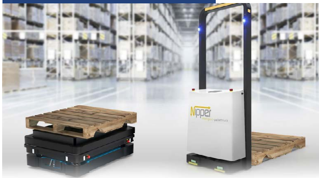
FIGURE 3, AMRS FOR PALLET TRANSPORT

Autonomous Mobile Robots (AMR) are self-driving collaborative vehicles that navigate around people and objects without the need of a track. The flexibility of AMRs is endless. Interchangeable top modules allow for materials of different shapes and sizes. By using AMRs for automated pallet transport, employees' time can be repurposed from point-to-point transportation to focus on more value-added operations.