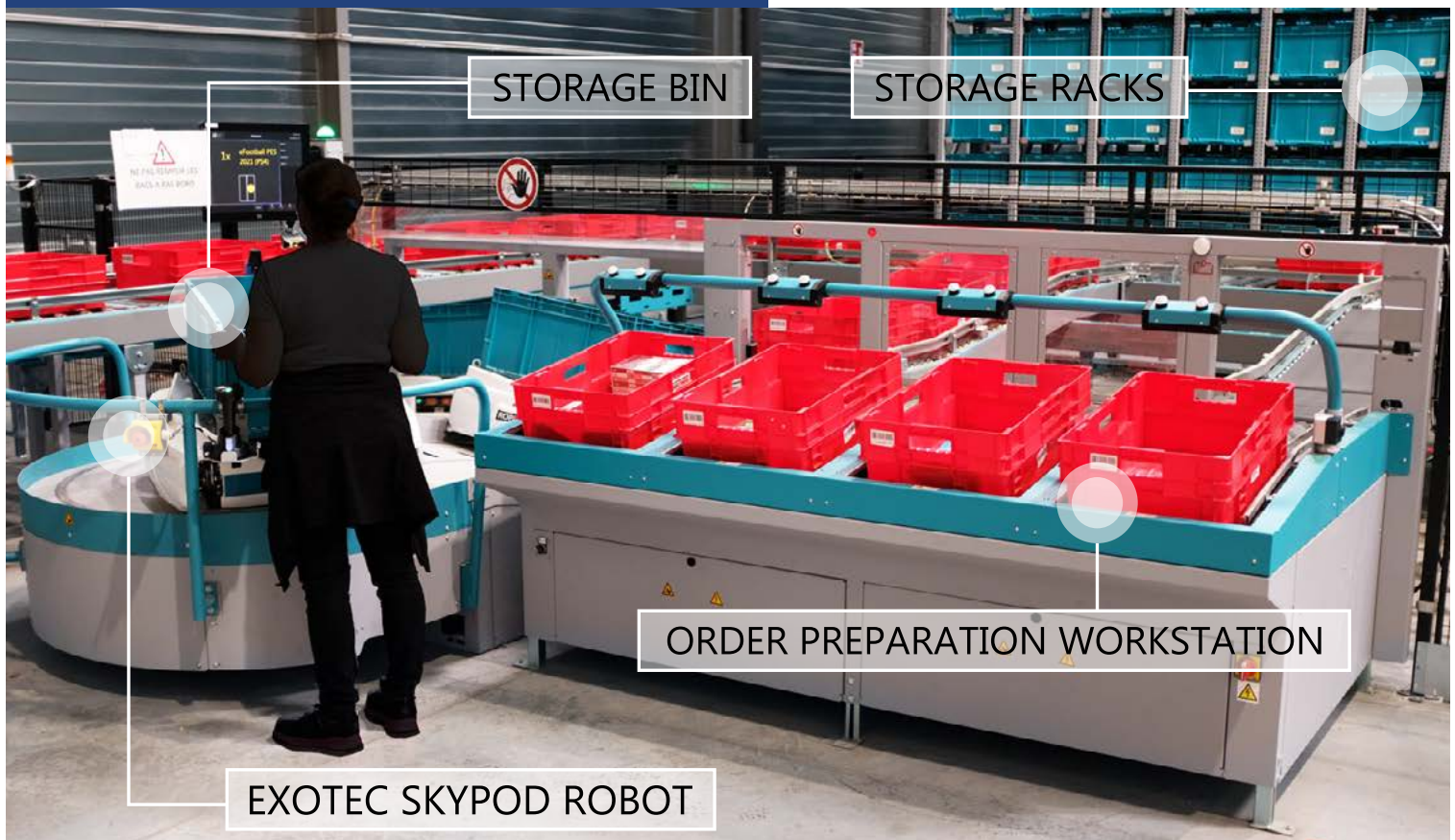
FIGURE 1, EXOTEC GOODS-TO-PERSON SYSTEM

The Exotec Skypod System is an automated storage and order preparation system. The Skypod Robots can climb the multi-level storage racks and move three dimensionally to retrieve the storage bins.